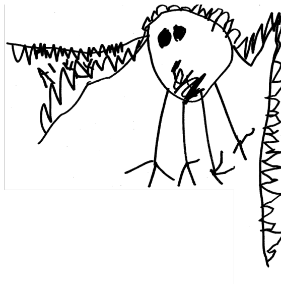
The crocodile is eating my name – Alex age 4

We acknowledge and believe that all children are successful, confident, and capable learners who learn at their own pace through different learning styles. Diversity is recognised and embraced in a supportive environment where all children feel secure, included, respected, and valued. We believe in allowing children the time to explore, question, analyse, reflect, collaborate, and take risks. Educators design an environment to maximise children's learning through collaborative and respectful partnerships between children, educators, families, and the wider community. We welcome and encourage family and local community involvement through a variety of spontaneous and planned experiences.