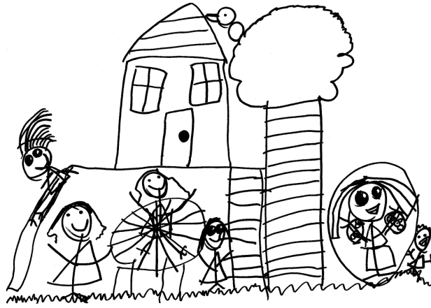
Playing outside with my friends – Evie aged 5

We believe that all educators, students and volunteers should feel welcomed, respected, valued, and appreciated as part of our team. Educators are encouraged to express their thoughts and ideas, knowing these will be listened to and seriously considered. We have a collaborative approach to leadership that allows us to draw on the ideas and experiences of all educators, including acknowledging the important role that our committee plays in ensuring our service operates effectively.